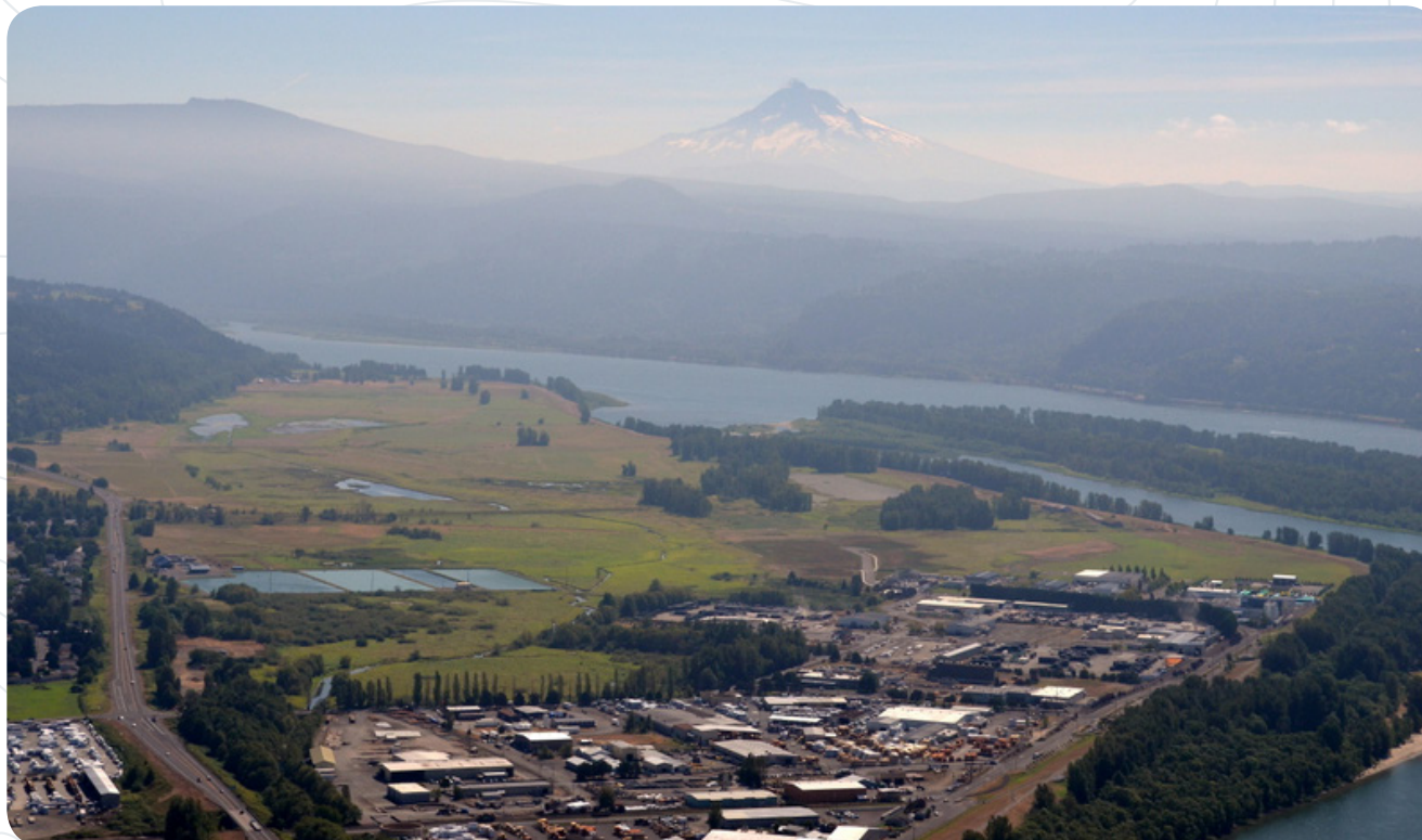
This photo is looking east. In the forefront is the Port of Camas-Washougal's Industrial Park and the City of Washougal's wastewater treatment plant. In the back is the Refuge and the Columbia River.